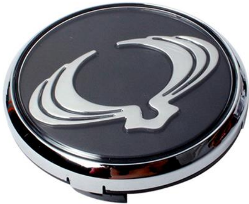
09AP034H00 SPINNING WHEEL CAP (1PCS)