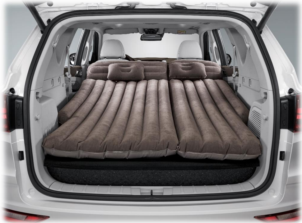
09AP036AM0 AIR MAT-CAR CAMPING (REXTON)